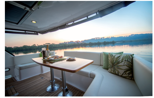
Length 13.90 m Beam 4.35 m Draft 1.40 m Displacement 15.000 kg