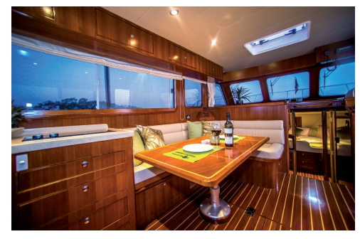
Fuel Capacity 1500 Litres Water Capacity 950 Litres Holding tank 115 Litres Construction Hand laid fibreglass