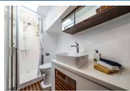
Fuel capacity 2500 ltr Water 1000 ltr Holding tank 200 ltr Construction Hand laid fibreglass