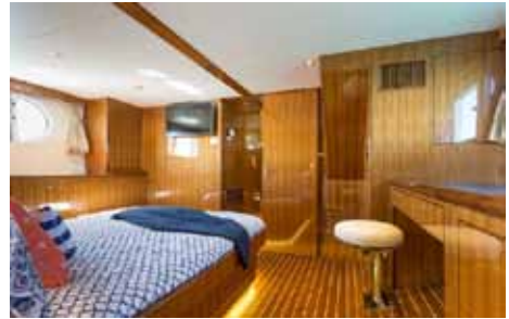
Length 16.20 m Beam 5.26 m Draft 1.40 m Displacement 18.000 kg