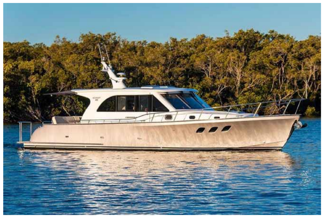
NP46014.00x4.20x1.05M Cummins QSB 6.7 480HP