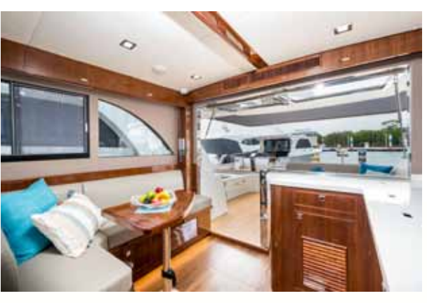
Our ships have everything you would expect from high quality,seaworthy ships. We attach great importance to comfort and handling of your ship. All our ships are semi-custom built and your special wishes with regard to lay-out,technique and navigation equipment can be fulfilled.

The standard specifications are already extensive and included in the competitive price.