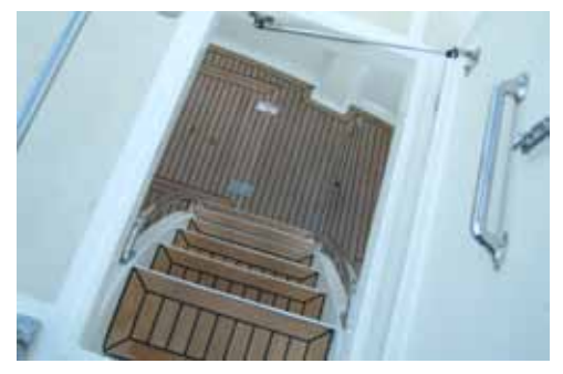
Length 13.80 m Beam 4.20 m Draft 1.21 m Displacement 15.500 kg