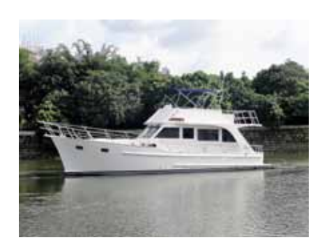
Fuel Capacity 1500 Litres Water Capacity 700 Litres Holding tank 175 Litres Construction Hand laid fibreglass